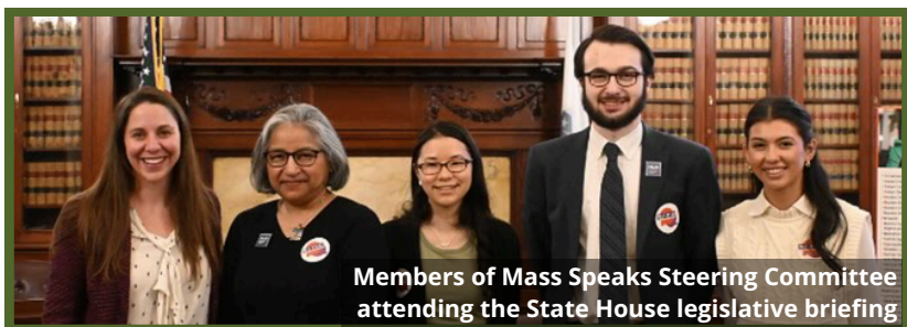
Members of Mass Speaks Steering Committee attending the State House legislative briefing