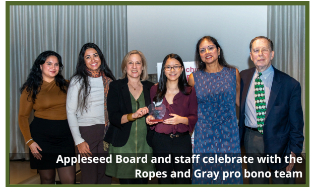
Appleseed Board and staff celebrate with the Ropes and Gray pro bono team

On November 13th, 2025, Massachusetts Appleseed gathered over 120 community leaders, supporters, and partners for our 17th Annual Good Apple Awards Reception in Boston. The evening celebrated champions of justice and highlighted the critical issues facing our communities, including youth homelessness, the school-to-prison pipeline, and barriers for non-English speakers navigating government systems. We were honored to recognize: