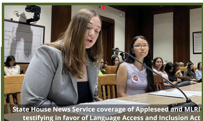
State House News Service coverage of Appleseed and MLRI testifying in favor of Language Access and Inclusion Act

As Co-Chairs of the Mass Speaks Coalition, MA Appleseed testified at the state house in support of the Language Access and Inclusion Act (H.3384/S.2125) . When state agencies only provide services in English, thousands of Massachusetts families are denied access to the services and information they need to survive, such as those to help put food on the table or navigate the child welfare system. We thank the entire Mass Speaks Coalition, made up of over 75 advocacy, research and legal service organizations, for standing with us and sharing their stories.